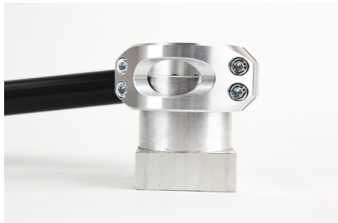
fork leg engagement). (Clamp doesn't have 100% fork leg engagement).

When transporting a bike do not use clip on bars as tie downs anchors !! clip on may snap.