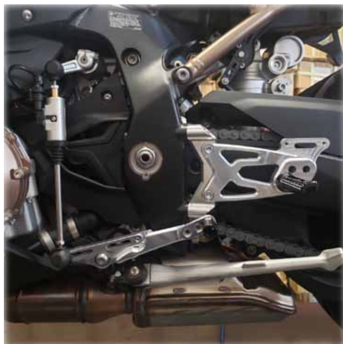
Shift side GP shift

THIS PRODUCT IS INTENDED TO BE INSTALLED BY A CERTIFIED TECHNICIAN*