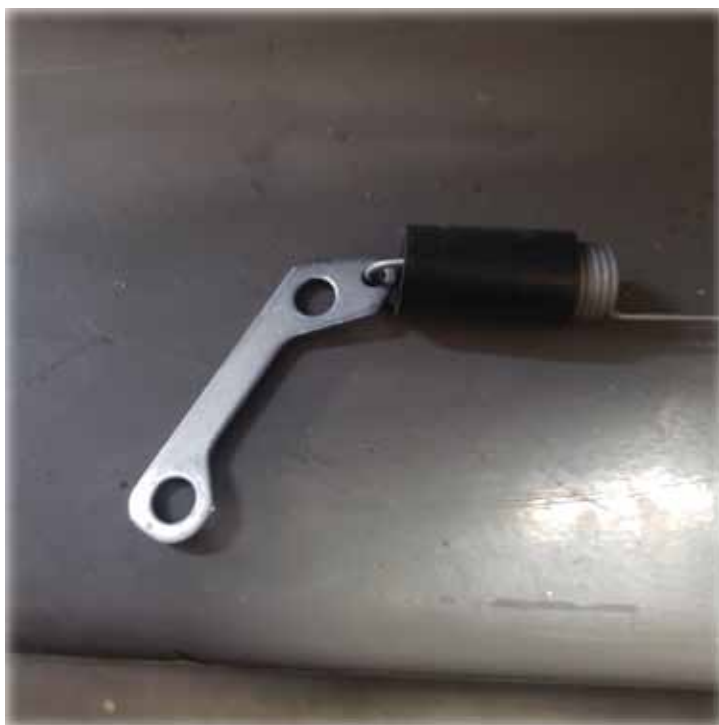
Reuse this part