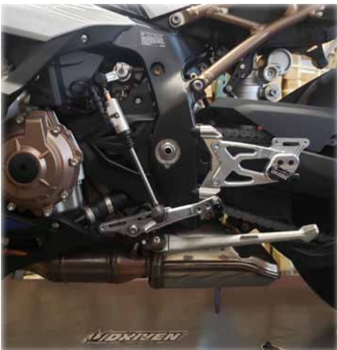
Shift side Std