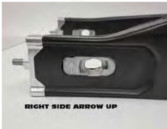
RIGHT SIDE ARROW UP

LEFT SIDE: CHAIN PULLER ARROW FACING UP CAPTIVE BLOCK PART NUMBER IS 100683