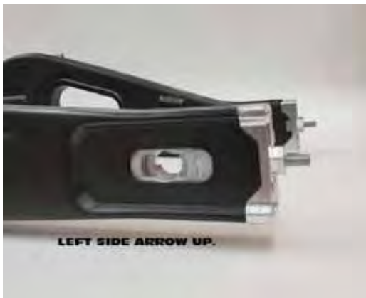
LEFT SIDE ARROW UP.