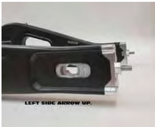
LEFT SIDE ARROW UP.